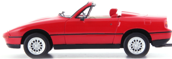
Mazda MX-5 Miata Concept Duo 101 V705 (J, 1984)