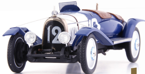
Voisin C3 S "Strasbourg Grand Prix" (F, 1922) dark blue / silver 105 mm (scale 1/43) autocult #01009