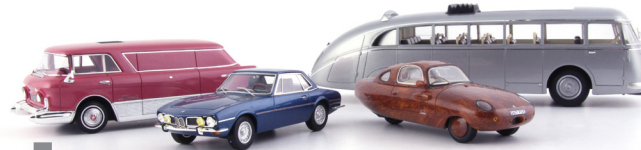
BMW 1600 ti Coupé Paul Bracq (D, 1969) dark blue 97 mm (1/43) #06034

technical changes and errors excepted • printed in Germany • # 99909